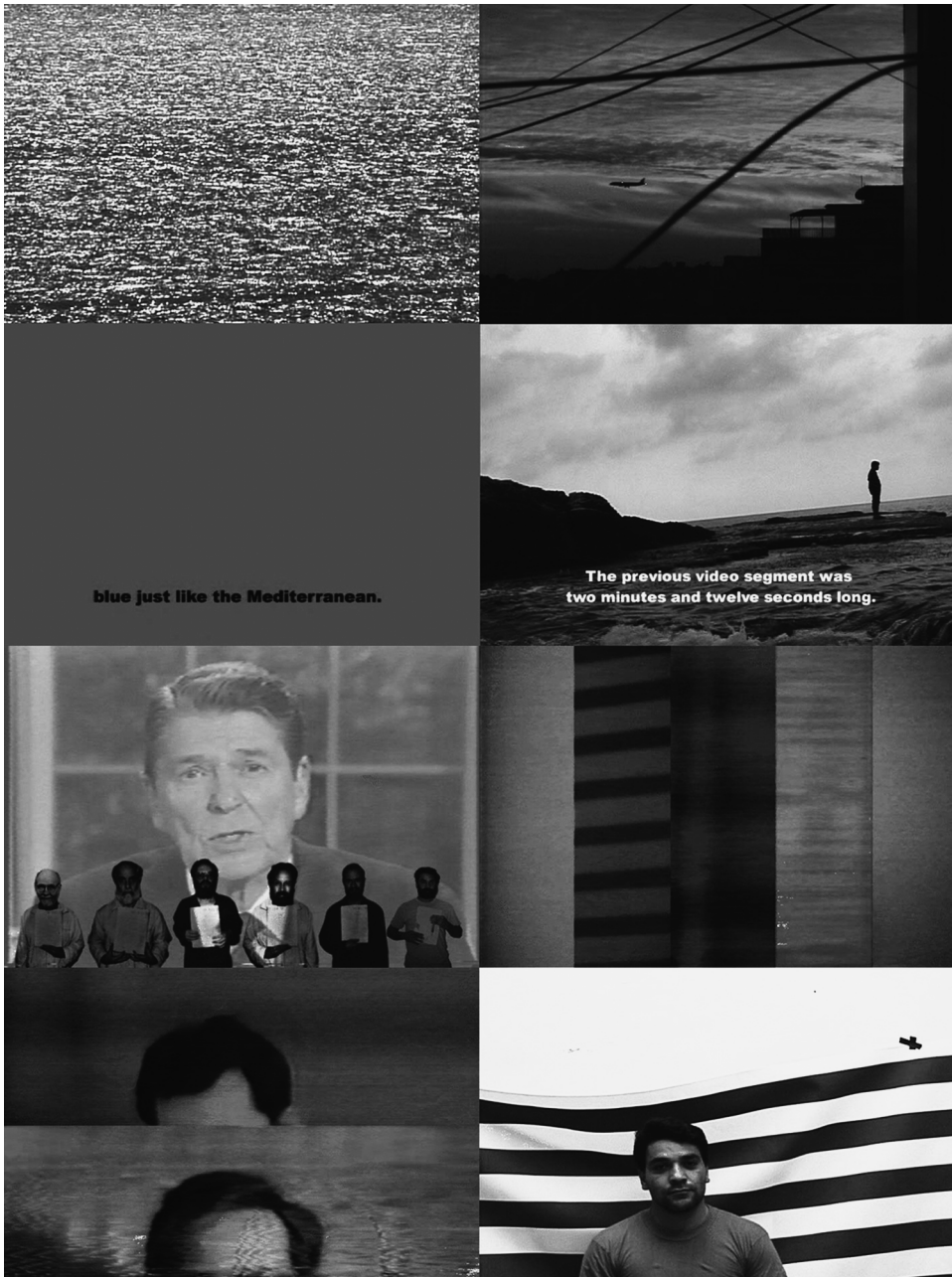
Walid Raad. Hostage: The Bachar Tapes (#17 and #31) English Version. 2000.