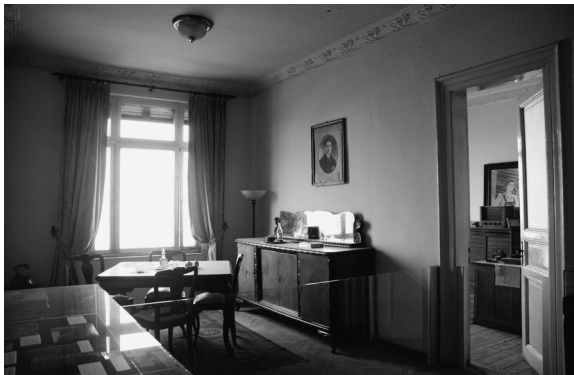
Michael Blum. A Tribute to Safiye Behar. 2005. From bottom: house museum installation; Safiye delivering speech at the 12th Women's Congress, Istanbul, April 1935 (Collection Women's Library and Information Center, Istanbul); plaque at site of Safiye's home, Hamalbası Caddesi No. 18, Beyoğlu.