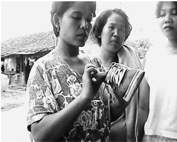
Blum. Two stills from My Sneakers. 2001.

with viewers, whose various configurations of knowledge and “horizons of expectation” determine whether something is plausible to them . While something similar is true of any artwork—that its meaning is produced in the encounter with the spectator—a parafiction creates a specific multiplicity.