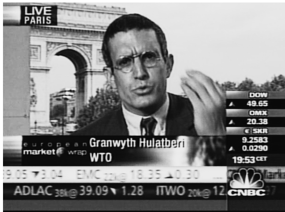
The Yes Men. End of the WTO. 2002.

positive identity correction, the target is made to announce strategies and transformations that are salutary from the point of view of the corrector, and that the actual person or entity must then choose to ignore or deny. 28