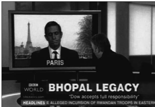
The Yes Men. Dow Does the Right Thing. 2004.

announcement (fitting that his name combined the patron saint of impossible causes and the world's end). One can only imagine their joy and corresponding disappointment when they learned that they still awaited justice. 40 Moreover, from some points of view any purposeful deception is inherently injurious. Consider the argument, which Sisela Bok put in ecological terms in 1978, that "... trust is a social good to be protected just as much as the air we breathe or the water we drink." 41 Though the Yes Men may have outsmarted Rove in 1999, in some ways the work they went on to do is itself a "funhouse-mirror" of that operative's infamous techniques. Surely, the performativity they deploy is the jester's version of "We're an empire now, and when we act, we create our own reality." 42 Such similarities can lead you to side with Bok and others who call for a return to honesty in personal and political communication. Or they can leave you agreeing with the Yes Men that precisely in such a climate, "we need to be devious in order to achieve a condition of honesty." 43 (Just what social trust, after all, do we imagine we would preserve, in arguing against the use of deception in cultural-political