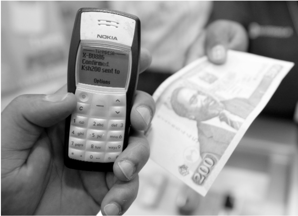
Figure 1. M-PESA screenshot.