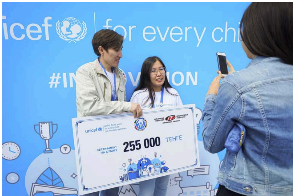
UNICEF Hackathon in Astana Kazakhstan, 2017