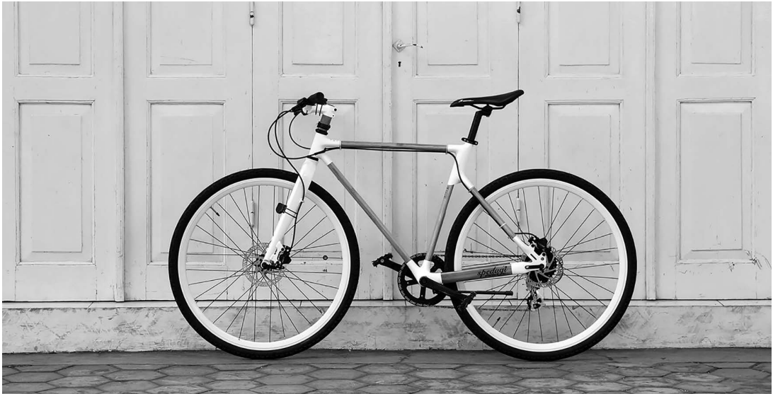
Figure 1 Spedagi Bamboo bicycle.

or planetary.” 20 She argues that scale—for instance, globalism and regionalism—is brought into being through a kind of conjuring that allows people to see the world in different ways. Projects are “scale-making” when they “make us imagine locality, or the space of regions or nations, in order to see their success.” 21 I consider the various forms of design activism in Kandangan as scale-making projects, generating objects, images, and systems that are located in the village but that challenge preconceptions of what the village means and how it relates to global design.