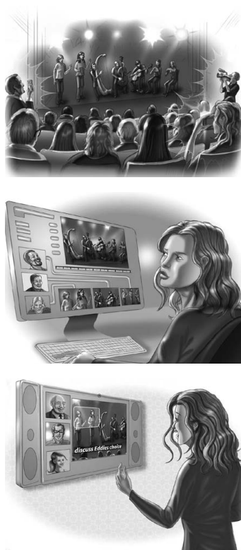
Figure 2 Drawings of a storyboard for MyVideos .

them to empathize with (imaginary) users and their experiences, and to more vividly imagine the sort of problems that TA2 aims to solve.