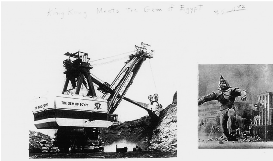
Robert Smithson. King Kong Meets the Gem of Egypt. 1972.

desperate for tourist revenue as local coal-seams have been depleted over the last half century. Faced with abandoned mines, toxic gob-piles, dead acid-drainage rivers, and de-populated ghost-towns, I discourage my students from indulging a simple poetics of rural dereliction, emphasizing instead aesthetic modalities such as the “spectral” and the “nonsynchronous” as the vanguard of twenty-first century art. 17 Teaching contemporary art and sustainability in Appalachian Ohio thus means, among other things, “learning to live with ghosts.” 18 Far from a melancholic fixation on the past, recognizing the “non-contemporaneity with itself of the living present” is the very condition of anything genuinely new to emerge in the future, and thus enables the “contemporary” to survive as an ethico-political question rather than a glib affirmation of novelty for its own sake.